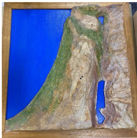
Photo of the relief map from another Atrium of the Catechesis of the Good Shepherd