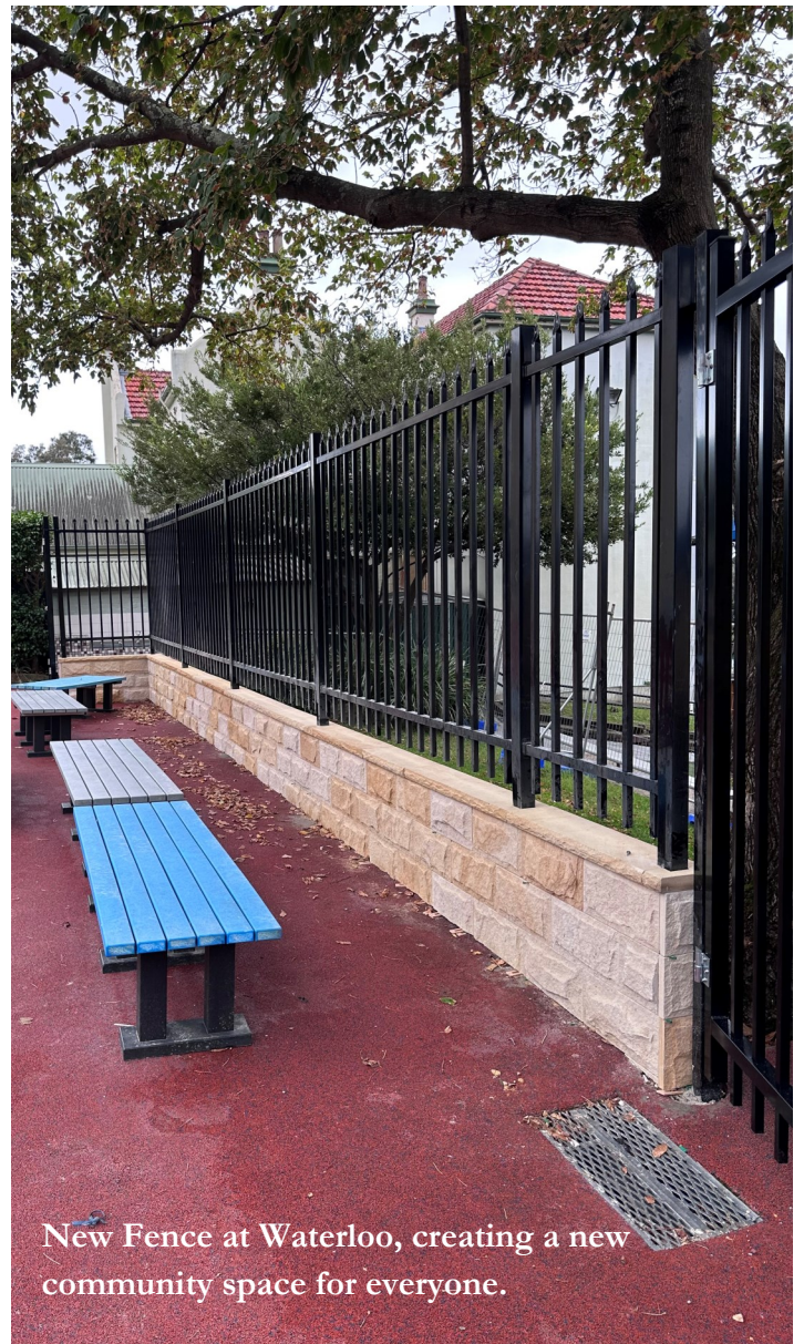
New Fence at Waterloo, creating a new community space for everyone.