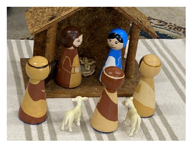
Materials to tell the story of the birth of Jesus and the adoration of the shepherds

A unique characteristic of the method she developed is the use of beautiful materials to help the child to encounter God and the Church through experiential activities undertaken with these materials. You can see some of the materials below.