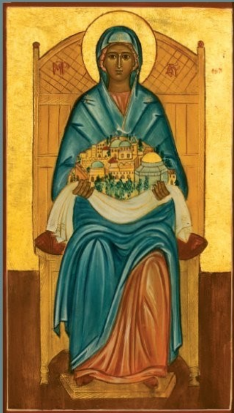
An icon that was hand-painted by the nuns of Beit Gemal (Israel)