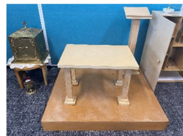
The Model Altar and Model Lectern