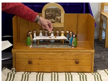
The upper room for the Last Supper presentation