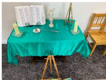
Cloths for prayer table

The materials we use in the Atrium are a very important part of the catechesis.