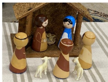
The stable for the Nativity presentation