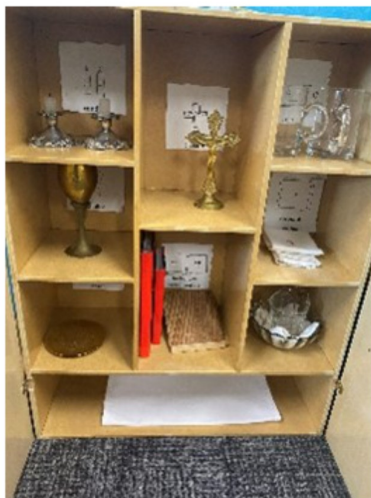
The Sacristy cabinet for the Model Altar

Please don't make the items yet as they need to be made using particular colours, dimensions and materials. These are laid out in a Materials Manual for Catechesis of the Good Shepherd, which I will provide to those helping out.