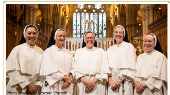
Dominican Sisters of St Cecilia